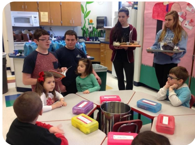
Students tasting barley soup

"preschool helpers" will teach the preschoolers mini lessons about healthy eating. Four to five mini lessons with topics such as why to try new foods, why to eat veggies, what does organic mean, and why buying local is important will be addressed through simple, hands-on, high school student-led lessons. Preschoolers will sample foods and then their families will be sent home with produce from the CSA share. Families will be asked to complete simple documentation as to what they made with the food. The goals of this initiative are to give younger students the chance to try new healthy recipes, to introduce to parents recipes that are both healthy and budget friendly and to send a positive message of sharing and cooperation.