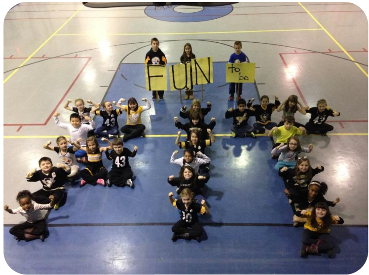
Photo of Get up and Get Active Students

Aiken Elementary School is implementing a Get Up and Get Active initiative that students can participate in before and during school. The overall goal is to get kids moving at least 60 minutes per day. To accomplish this goal, Aiken is incorporating physical activity into every aspect of the day through activities such as morning walking/jogging club, biking in health class, class dance breaks, monthly family fitness challenges, and much more. Students are tracking their progress over six weeks by completing a Kids of Steel Log and monthly home workout challenges. Students are also given the opportunity to develop a workout lesson to teach the class.