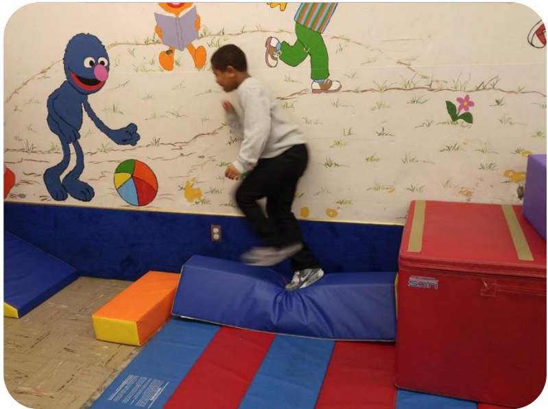
Kids playing in recreation area on equipment purchased with grant funds

PLEA is a School Based Partial Hospital, licensed by the Pennsylvania Department of Education. PLEA serves as an alternative education placement for students on the autism spectrum of disorders who also have severe or moderate cognitive delays. The goal of “Wellness at PLEA” is to increase physical activity through skill building and increase socialization through play. PLEA’s wellness initiative will provide a play center, new equipment, and more daily physical activity time for children. Successful activities include building with Legos, playing with trains and pretend play with plastic food, which equip students with the prerequisite skills needed to have friends.