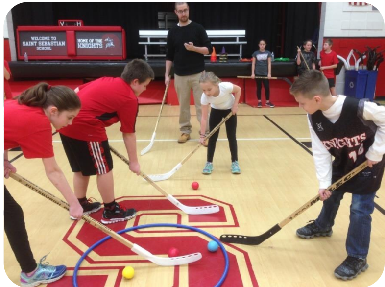
Students in physical education class

Saint Sebastian School has utilized the SPARK! program to improve physical education offerings to students as well as provide more opportunities in health education. Approximately 400 students K-8 are benefiting from an increase in moderate to vigorous physical activity during their school day. Saint Sebastian School is embracing a Fitness-for-Life