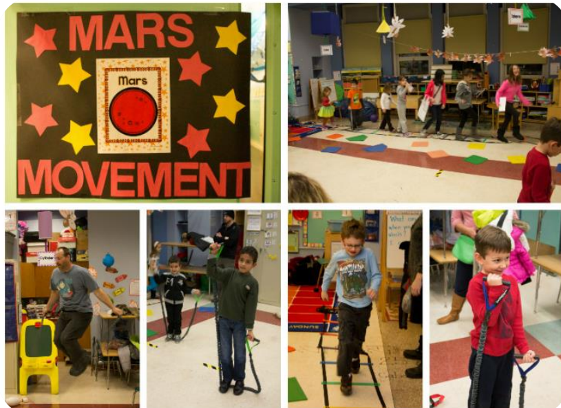
Photo of Family Evening Events

Pittsburgh Banksville is continuing its initiative to incorporate physical activity and nutrition education into the classroom. Students taste new foods and learn cooking skills and plan, plant, and maintain the school greenhouse.