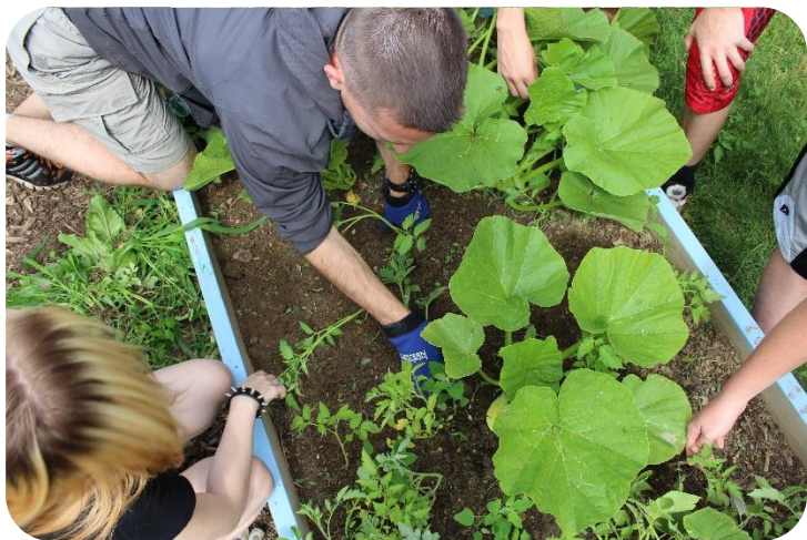
Photo of Rachel's Neighborhood Garden

The Hiland School Garden project installed raised garden beds on the center's campus, allowing students to plant seeds, grow plants and taste locally grown fresh fruits and vegetables. Hiland is committed to community involvement by bringing parents and caregivers to visit the garden and staying connected to the Rachel's Neighborhood Garden located at Allegheny Valley School District grounds. Students using the garden are able to draw pictures of what they did to the garden to help get it ready and identify what they grew in the garden. Students will use a journal over the summer to document the garden transformation.