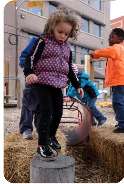
Kids on new playground

Shady Lane School transformed its outdoor play area into a Neighborhood of Make-Believe, where students run, play and learn about gardening with fruits and vegetables. With the transformation, enrolled children will increase the amount of time they spend playing each day and enjoy healthy snacks in the play area and garden. Parents and caregivers at Shady Lane School are critical in the development stages and the success of the play space and food service. Educators now write daily to all parents summarizing playground activities and tips to continue the activities at home. Shady Lane parents desire to have healthy snacks and lunches served and are working with the school to tailor menus. Shady Lane proudly reports that children are now eating far more healthy snacks, many of which they grew over the summer.