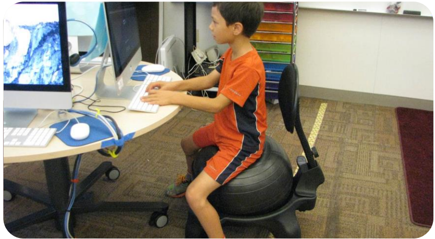
Ball chair in the Kinesthetic Classroom

Falk Laboratory School will introduce students to a kinesthetic classroom equipped with standing desks and balance-ball seating. This initiative will improve kids' ergonomic experience, reduce kids sitting time, and provide more opportunities to move and be mindful about their environment and physical well-being. Teachers will compare attention and movement of students at standing vs. sitting workstations and ball vs. chair workstations and explore whether student behavior differs when they are assigned to standing or ball stations as opposed to self-selecting. Data collected to date shows students have expressed satisfaction, comfort and ability to stay focused when using the more kinesthetic workstations in class.